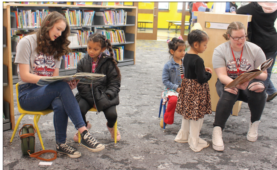
Nearly 500 people attended Read Across Russell County last Tuesday at the Russell County Public Library (RCPL). The event, sponsored by the RCPL and the Russell County Education Association, featured local dignitaries, students, and athletes reading to children, and participating in literacy-themed activities.