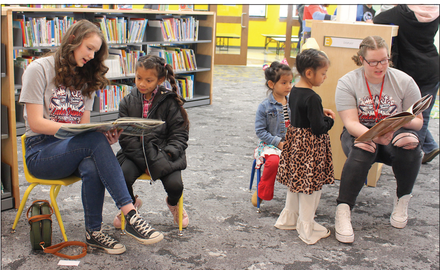
Nearly 500 people attended Read Across Russell County last Tuesday at the Russell County Public Library (RCPL). The event, sponsored by the RCPL and the Russell County Education Association, featured local dignitaries, students, and athletes reading to children, and participating in literacy-themed activities.