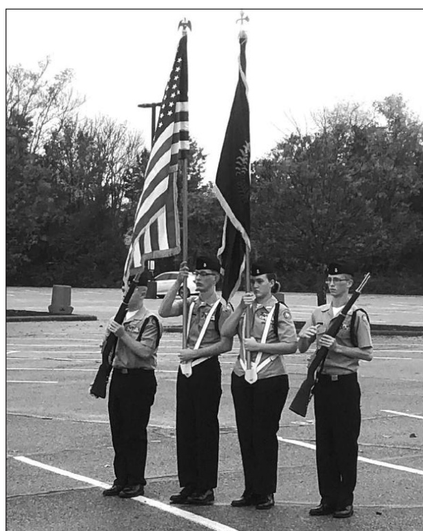
JROTC Drill Competition