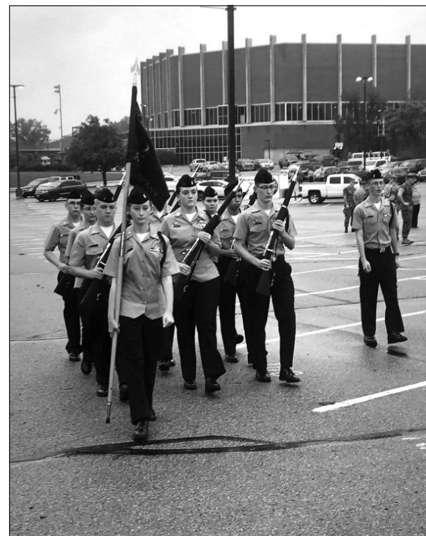
JROTC Drill Competition