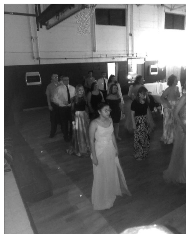
JROTC Military Ball