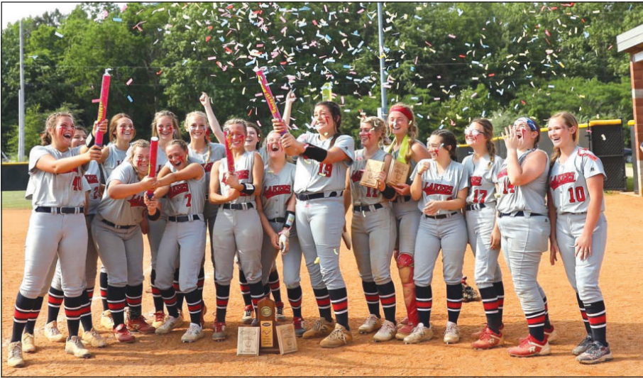
Lady Lakers Celebrating Their District Championship