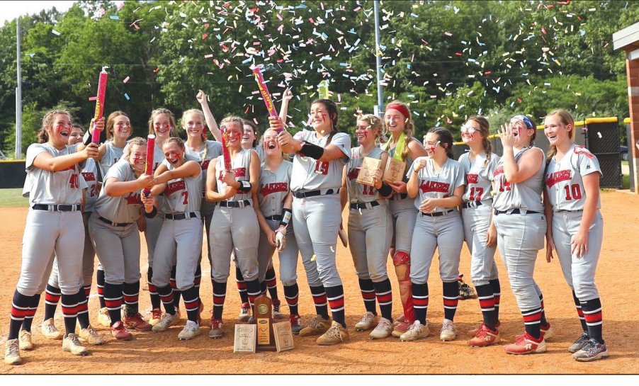
Lady Lakers Celebrating Their District Championship