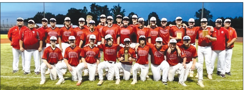
RCHS Laker Baseball

The Laker Baseball Dynasty continues its reign. Last week the Lakers breezed past Metcalfe and Clinton to clench the 16th District Title.