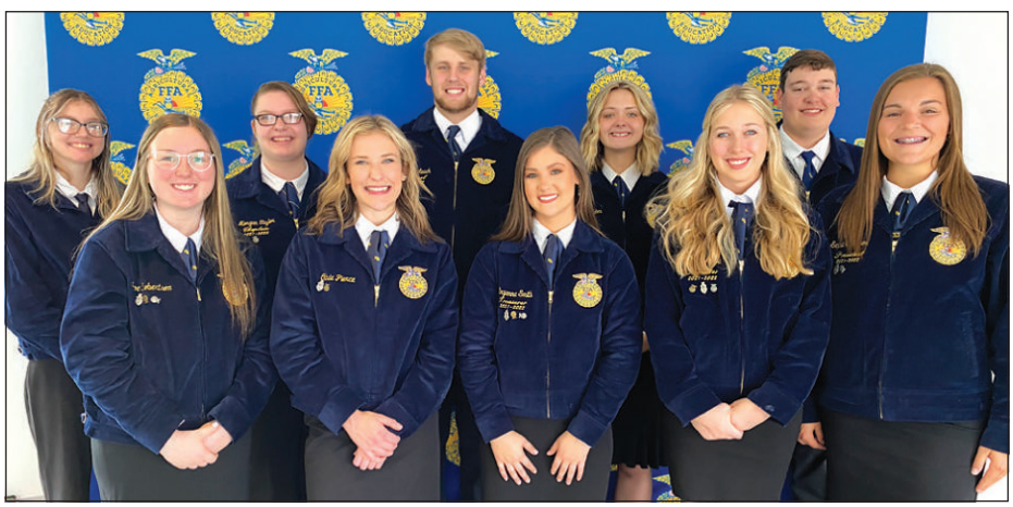
Russell County FFA Chapter definitely left their mark in Lexington at the convention.