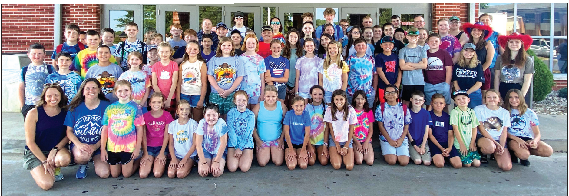
Russell County 4-H members that attended camp.