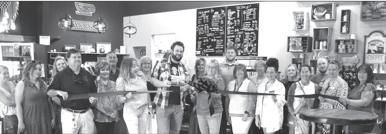
A ribbon cutting was held last Thursday for the much-anticipated opening of Java Springs. The county’s newest coffee shop/boutique, located at 23 Bernard Lane, just off U.S. 127, is now open Monday through Saturday, 6 a.m. to 6 p.m. Look for a feature story about them in a future issue of The Times Journal.