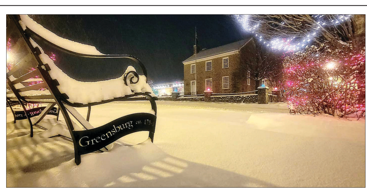
Downtown Greensburg was bright with snow and Christmas lights.