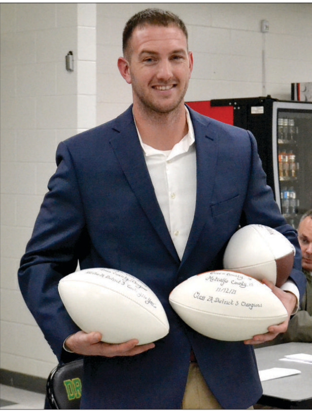
First year Head Coach was honored by the football team for three specific events this year. One football was for his first varsity win, a 40-0 win over Nelson County in the first game of the season. The second football was for the team's 32-12 win over Metcalfe County to become district champions. The third football was given to him to celebrate being named Coach of the Year in Class 2A, District 3.