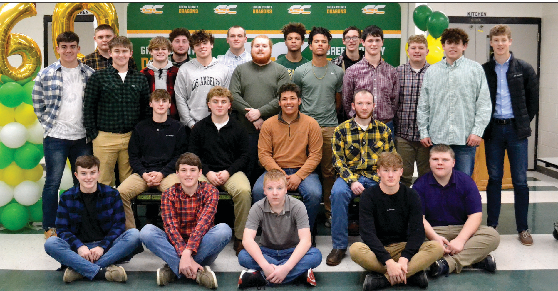
Green County High School's football team, Team 60, celebrated this year's season with an awards banquet Sunday afternoon at GCHS. The Dragons finished one of their most successful seasons in recent history with a record of 11-2, losing only to Metcalfe County during the regular season and Mayfield in the regional championship game.