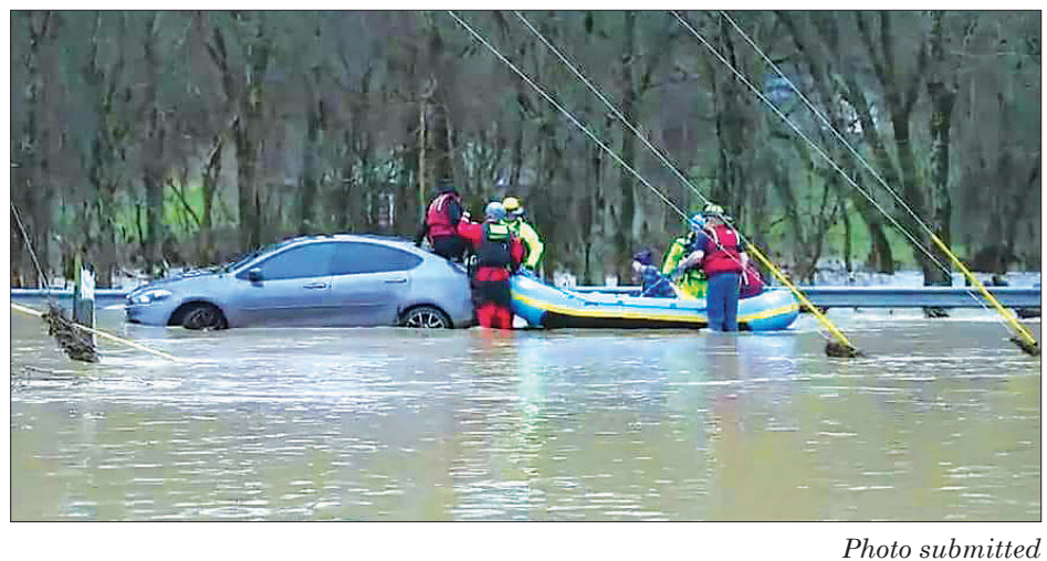
Rescuers work to remove flood victims and get them to safety.

Three Taylor County Another boat was de- Rescue personnel in a of one of their own af-"They didn't make it ter he was ejected from