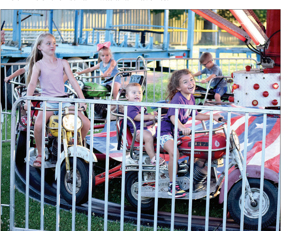
Lots of motorsports took place last week at the Green County Fair. Motocross just happened to be in the carnival, not the arena.