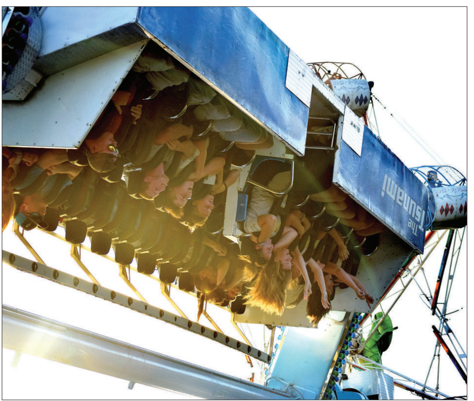
The thrills of the Tsunami was a fair favorite.