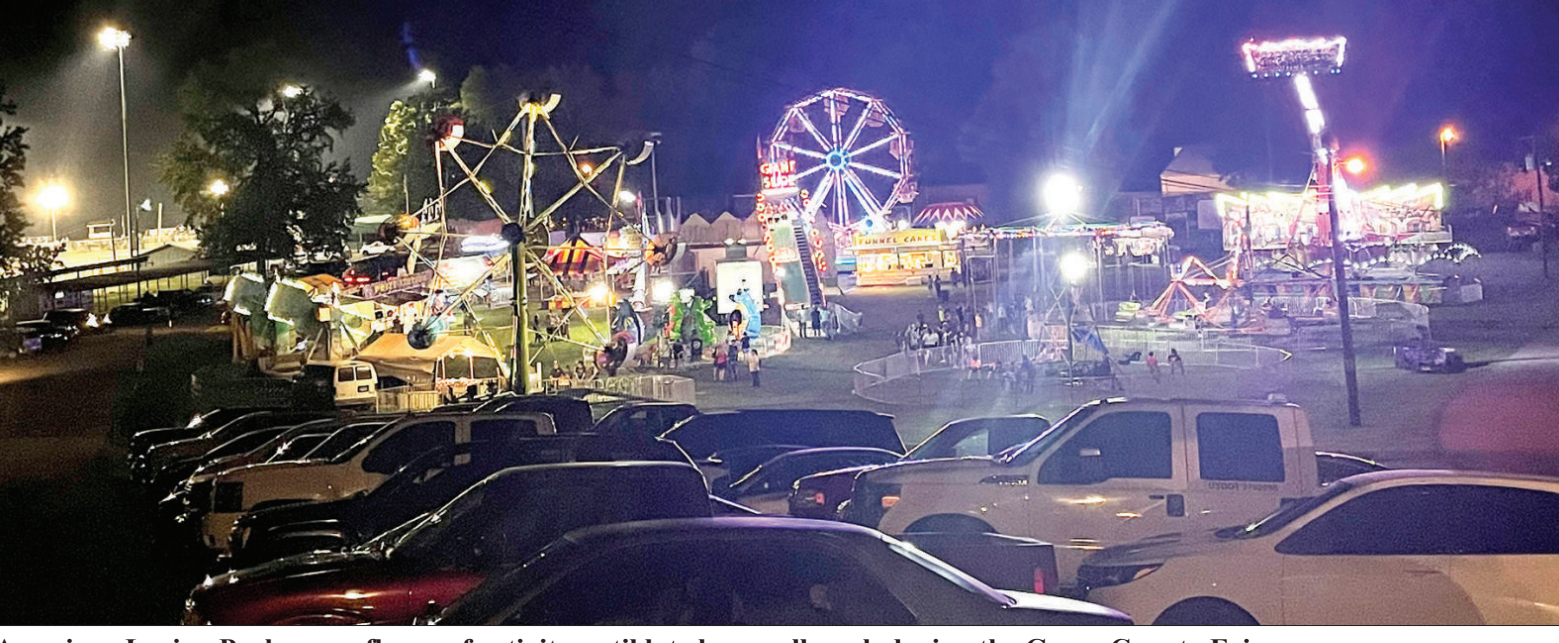
American Legion Park was a flurry of activity until late hours all week during the Green County Fair.