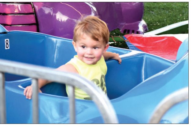
Who knew riding a dinosaur could be so much fun? This little guy couldn't contain his smile Friday night at the Green County Fair.