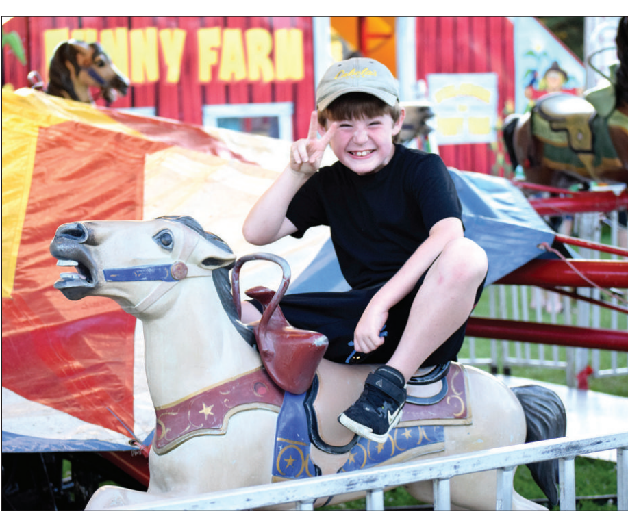
Kids of all ages enjoyed the rides at the Green County Fair. Some even hammed it up for the camera.