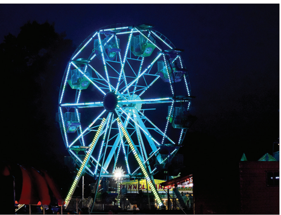
The ferris wheel lit up American Legion Park Tuesday through Saturday last week.