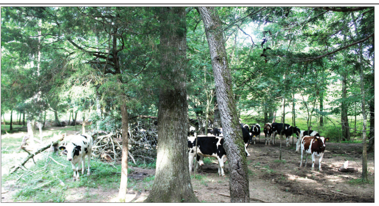
The Cowherd's Holstein heifers find a shady area during Friday's hot and humid weather.