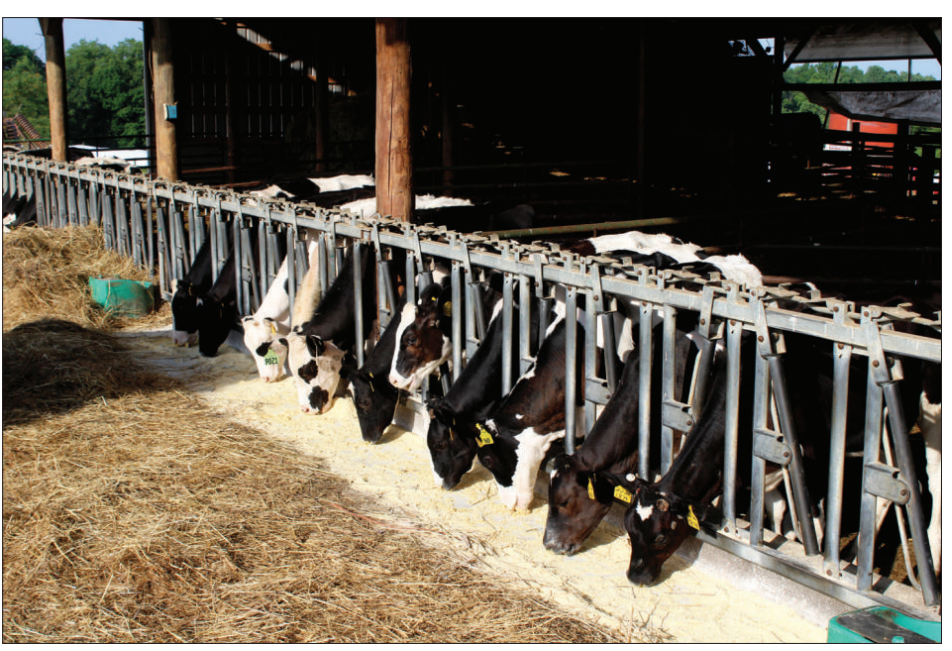
Holstein calves, on the Cowherd farm, help themselves to mixed feed.