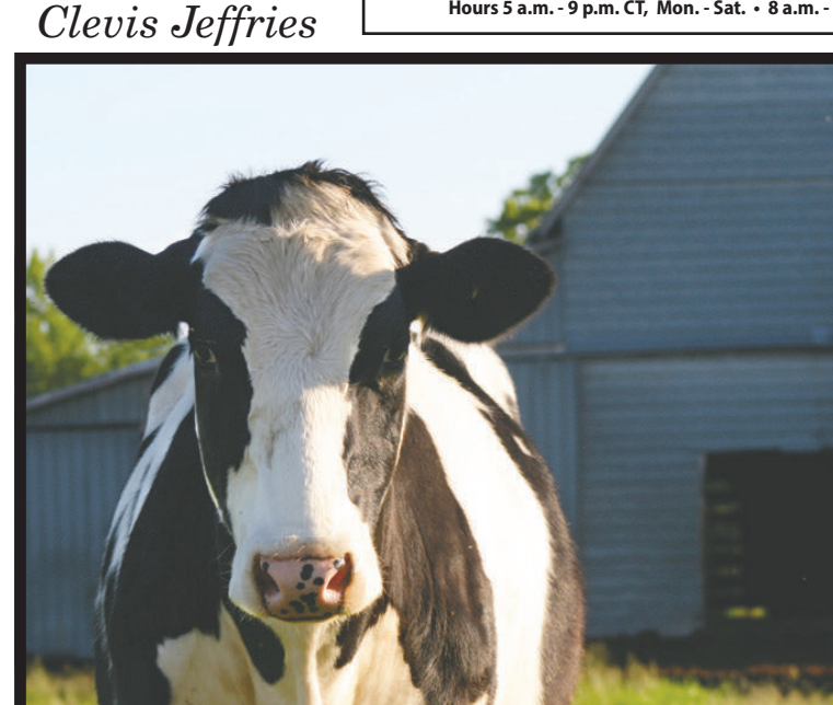
Thank a Dairy Producer & Drink some MILK... Churn the CREAM & Cut the CHEESE!!!

Grocery & Hardware Hwy. 218 • Pierce • Store - 270-565-5111 • Hardware - 270-565-5100 Grocery Hours 5 a.m. - 9 p.m. CT, Mon. - Sat. • 8 a.m. - 9 p.m. Sunday