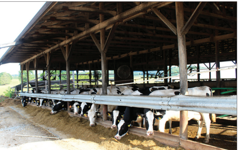
Holstein cows enjoy their feeding time.