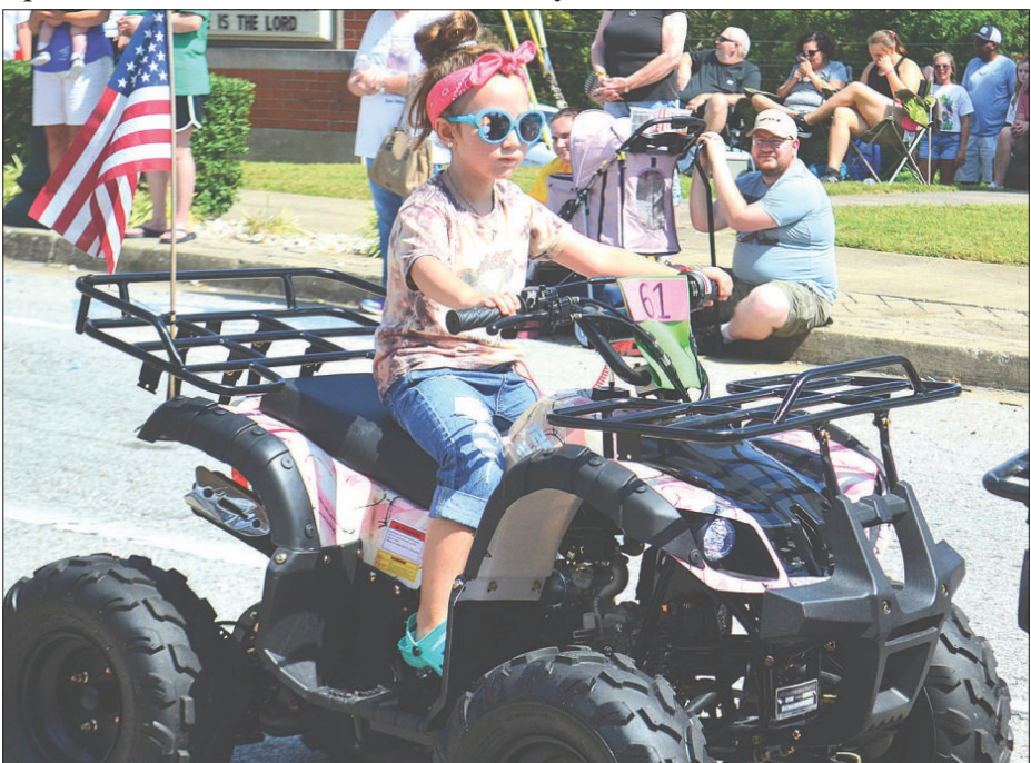
All business-- the parade was filled with youth on a mission!