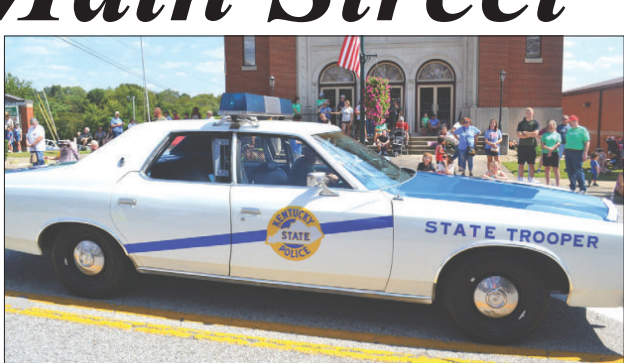
This state trooper car, featured in the Car Show earlier in the day, was a sight to see in the parade.