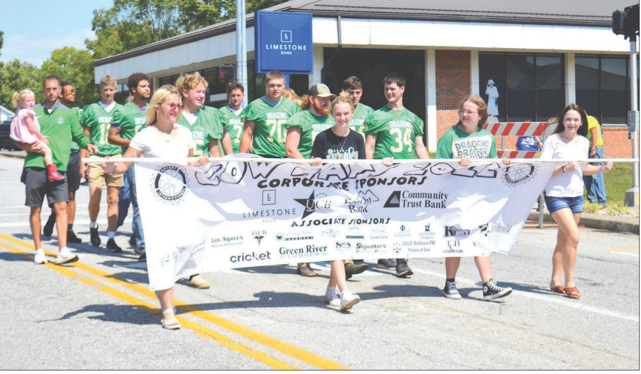
The grand marshal of the 2022 Cow Days Parade was the Green County Dragons - Team 60.