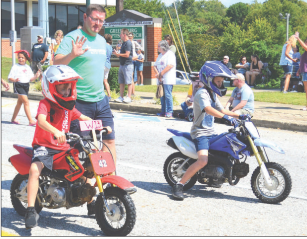
Kiddos on a dirt bikes were a crowd favorite Saturday.