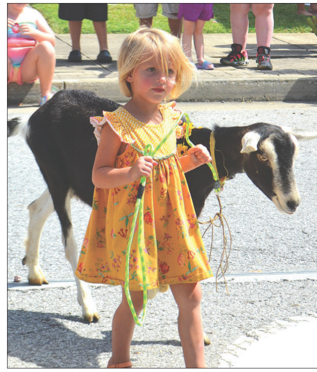
Sweet children and animals walked in the parade Saturday afternoon.