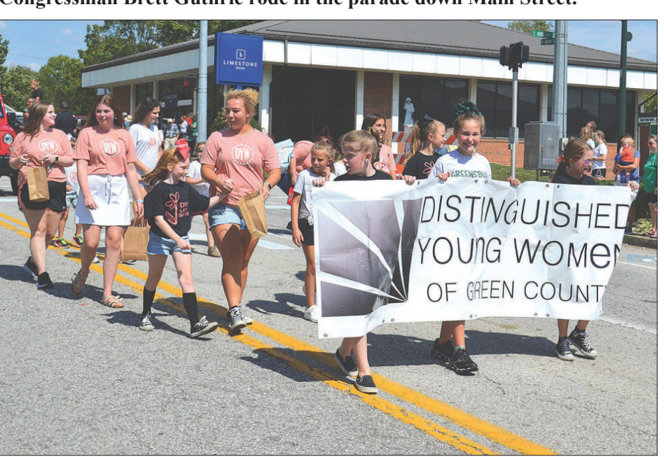
Green County DYW and their Little Sisters represented the program Saturday.