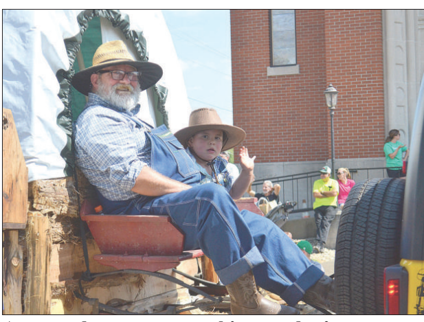
A covered wagon-- something we don't see everyday came down Main Street.