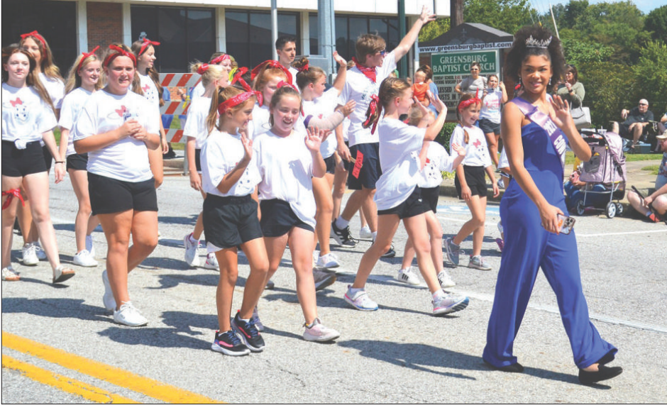
Damon's CTA Cheerleaders walked in the Cow Days Parade, with the 2021 Cow Days Queen leading the way.