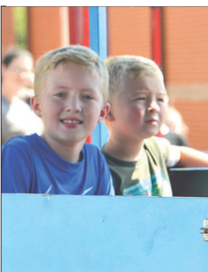
Train rides for everyone!