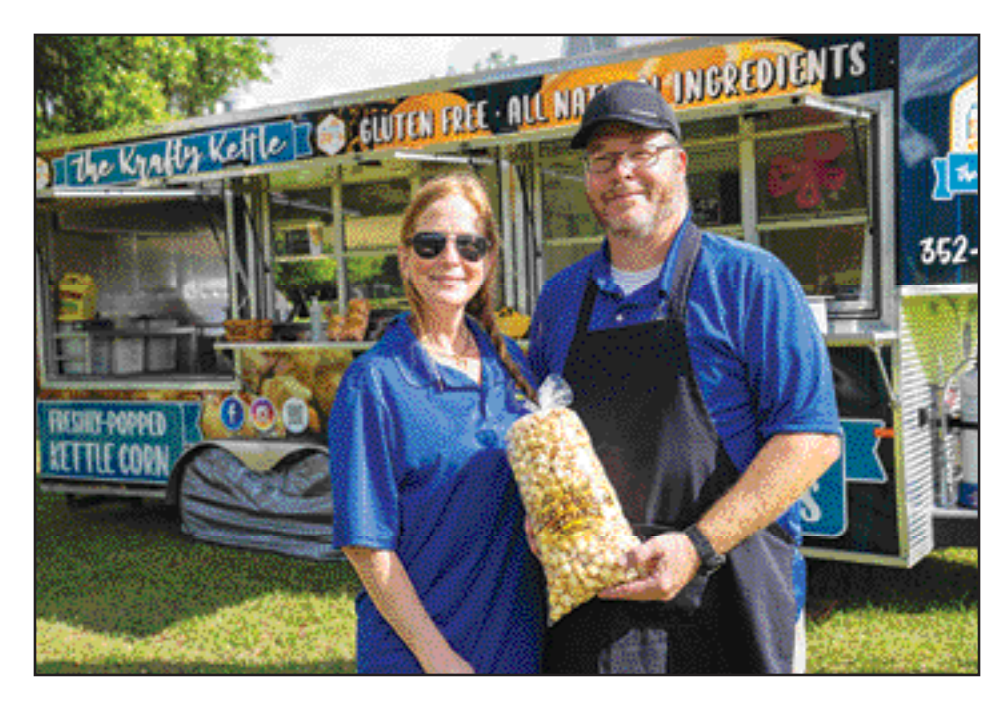
The Krafty Kettle