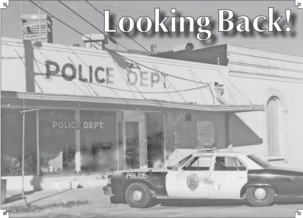
Vintage photo of the Donelsonville Police Department. Can you name the year the photo was taken?

Drop your images off for scanning at the Donelsonville News' office or send them to history@donelsonvillenews.com