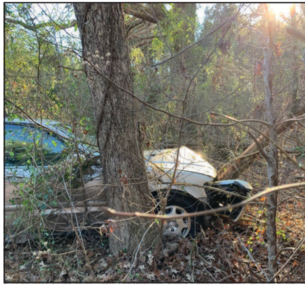
Deputies were dispatched to a single car accident on highway 81 just south of Mt. Carmel. The lone vehicle with two occupants left the roadway and crashed into a grove of trees. The passenger had a compound fracture to his leg and was transported to a local hospital. The driver was shaken, but unhurt. Alcohol is suspected as a factor in the accident. The SC Highway Patrol (SCHP) was called to work the incident.

Deputies confirmed the vehicle was stolen, the victim was contacted and advised he had not given permission for anyone to drive his vehicle. Richmond County officials were contacted and requested McCormick deputies impound the vehicle for processing. A report was generated for informational purposes.