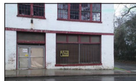
Long abandoned original Reporter building.