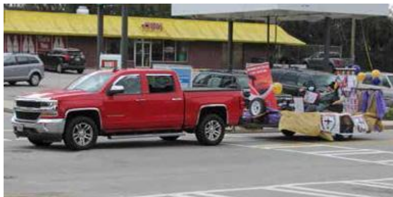
The winner of the float contest cruises to the Square