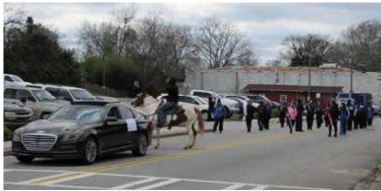
Parade participants march down Robert Toombs Avenue