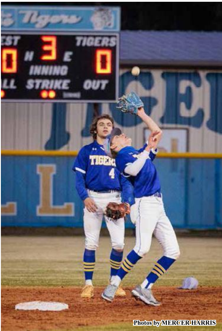
A Tiger catches a fly ball