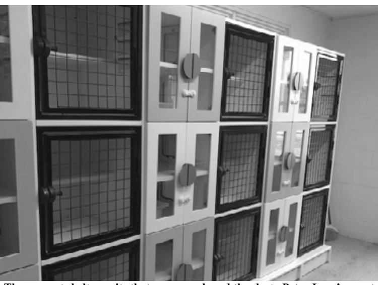
The new cat shelter units that were purchased thanks to Petco Love's grant