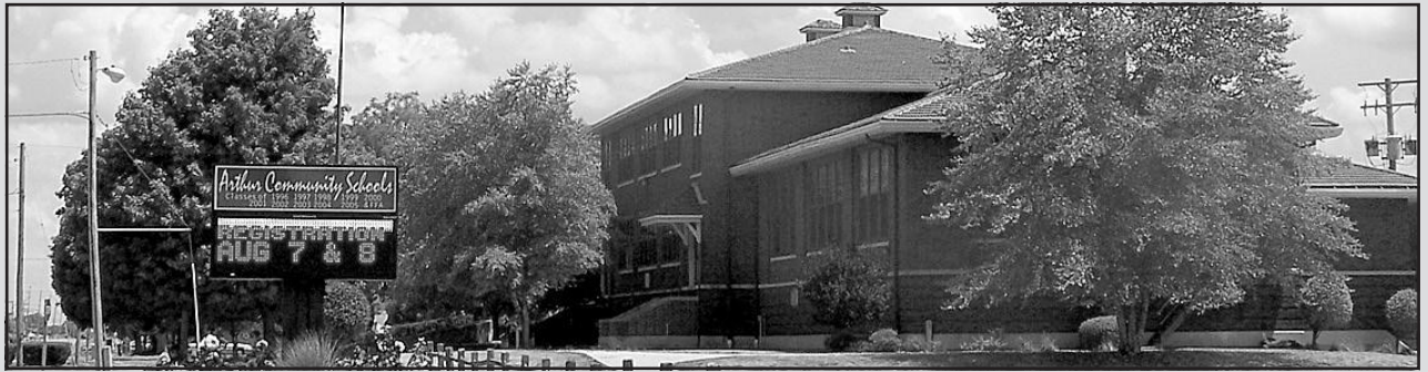
ALAH High School