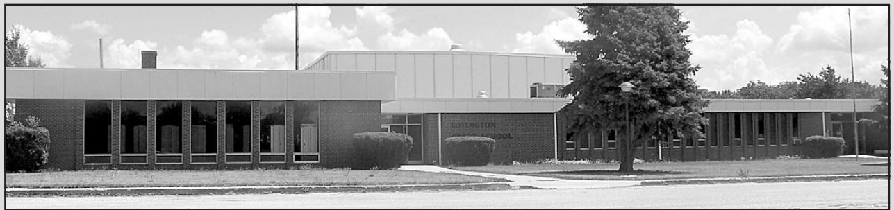
Lovington Grade School