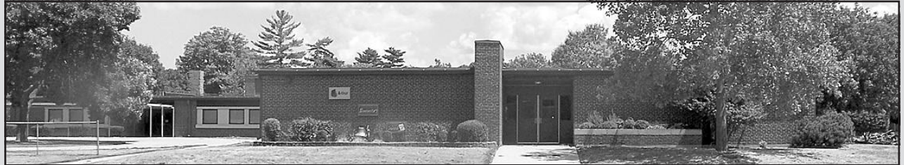
Arthur Grade School