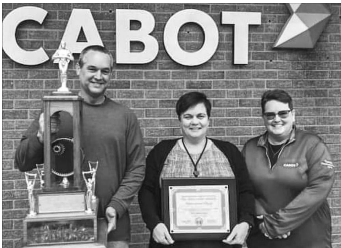
CABOT IN TUSCOLA received the 2021 Industrial Plant of the Year award from the Illinois Association of Water Pollution Control Operators. The award recognizes the wastewater treatment operations at the Tuscola plant and underscores the company's commitment to responsible water consumption and management as part of its sustainability agenda, according to their statement online.