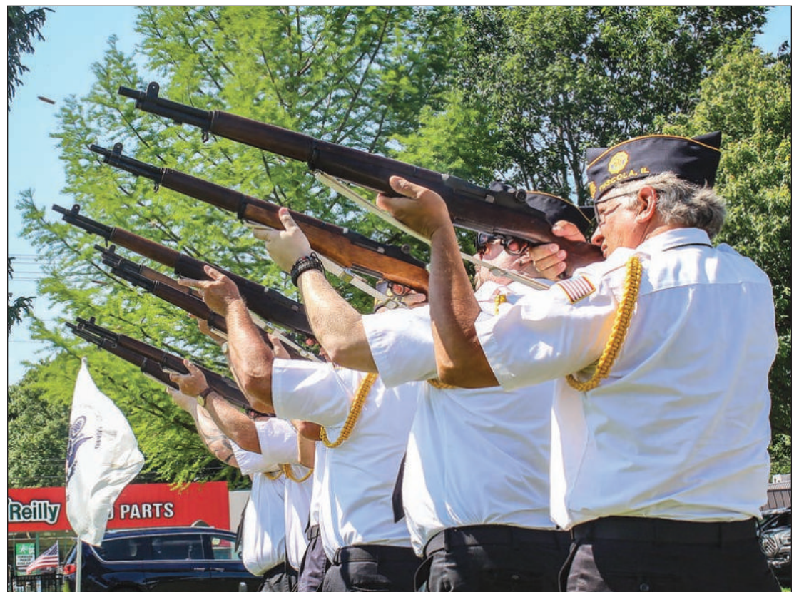
THE HONOR GUARD FIRES a 21-gun salute during Memorial Day services Monday at the Tuscola Township Cemetery.