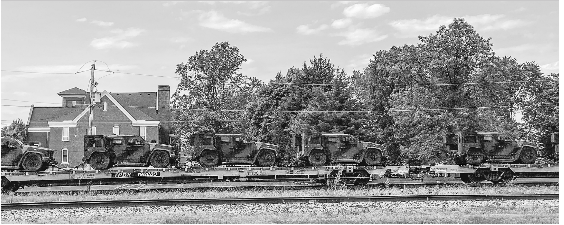
WITH EVERYTHING going on in the world today, residents may have been concerned two weeks ago to see about 40 train cars roll west through Tuscola carrying military vehicles. We reached out to former Tuscola resident Maj. Gen. William Enyart (retired) to see if he had any insight about the large volume of trucks being moved. "Not a clue," he said, "but this time of year, it's likely they're being moved to a summer training site. They could also be being moved to a depot for refurbishment; they look pretty old." Enyart was the keynote speaker at the National Guard Association's annual meeting last Friday in Springfield (see page 7) and said he heard no chatter there.