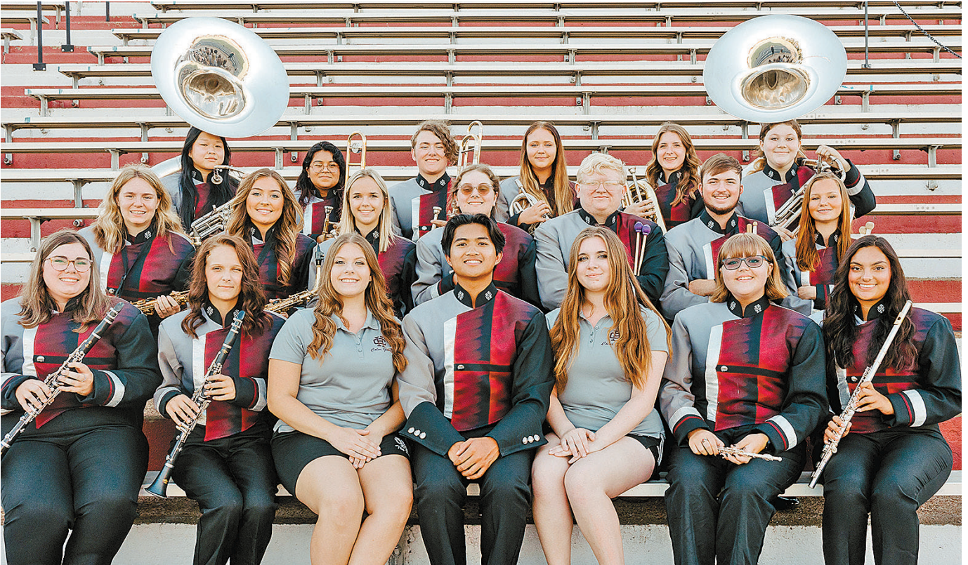
Senior Band Members