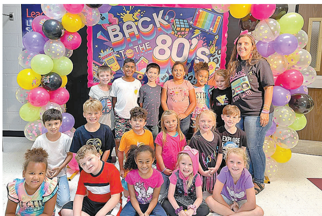
Parris South Elementary's 1st graders.