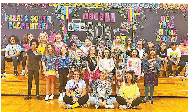
Parris South Elementary's 5th graders.