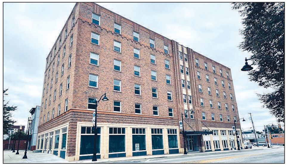
Lofts on the Square in Belleville, a recently completed project by Holland Construction Services.

The effort is driving revenue for the company. Holland now has a backlog