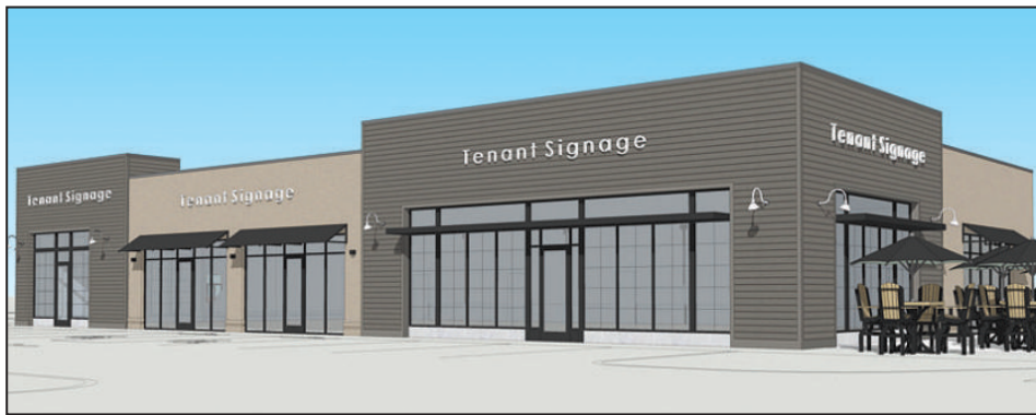
A rendering of the site in O’Fallon which will duplicate the Edley’s Bar-B-Que in Glen Carbon.