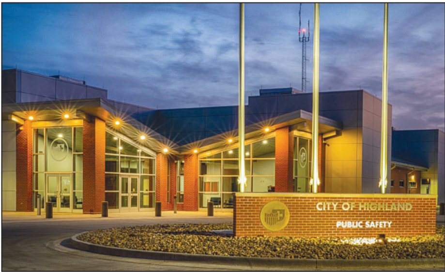
The new Highland Public Safety Building completed by S M. Wilson & Co.