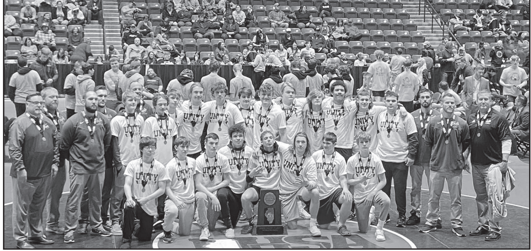
Unity Rockets Wrestling team pose with their hardware at the IHSA State Finals.

with another AOA regular. QB from Elmhurst College to perform another year. This year, the list of acts also included Secondary Dominance, a new A Cappella group from Illinois State University who were just as outstanding as the rest of the returning acts. UHS's Surreal Sound and a group from Unity West's fifth grade class also sang, some of the fifth graders performing on stage for the first time. The event brought college students and parents alike together for a night of comedy and music, and the support for Unity's music programs was apparent.