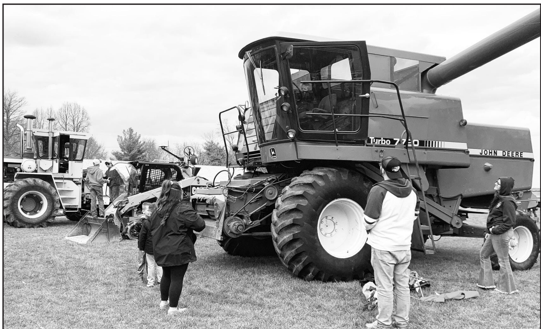
Unity's FFA members brought their farm animals to East Side Park in Tolono on April 6. Families in the Unit 7 got the chance to touch and learn about the animals as the high school students stood by to answer questions. Photo above shows 2.5 year old Dane sitting inside a