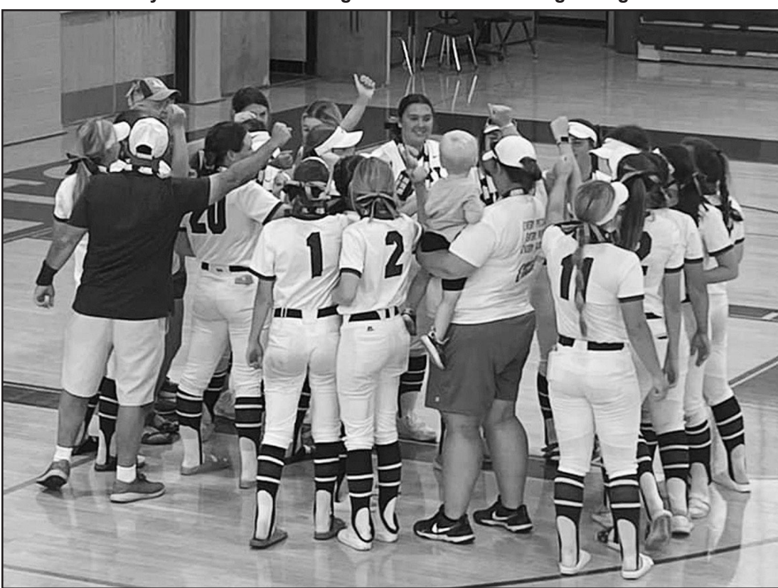
Unity Softball Team set common goals and worked through many obstacles to achieve their winning season.