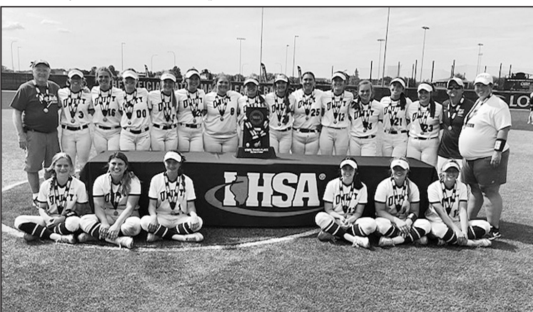
Unity Softball Team managed to conquer the goals they set for themselves at the beginning of the season. One of those goals: a better finish in IHSA than the 2021 4th place finish. The team finished their season winning 3rd place at IHSA this year, congratulations to the Unity Softball Team for a great season of crushing their goals!

To say I am proud to be a small part of this program and community is an understatement. The seniors will always be a huge part of our school, our community, and the softball program- making program history two years in a row. These girls have turned into young women leaders and for that, I'm grateful. They will each go their separate ways. Three of them continuing on with their softball careers, and five of them going on to do great things in college and beyond. They each have left a mark on Unit 7 and there fellow teammates and will be missed.