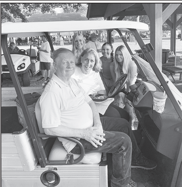
Tolono Fun Day committee felt good about their June 24th and 25th weekend with festivities for citizens and visitors, many coming to check out the numerous activities for all ages. Some of the highlights included a big parade on Saturday (6/25) that had a spotlight on the fireworks tradition with a couple dozen Boom Boom Boys, of course the fireworks show at the end of a full day of events including music, a big car show, kiddie tractor pull and beer tent along with fair food/drinks and vendors selling their unique items had the community enjoying the patriotic party.