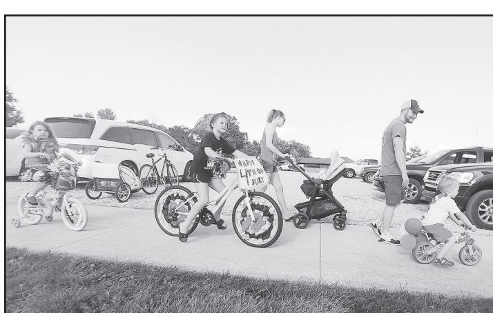
Photo above: The Villa Grove Freedom Celebration Patriotic Bike Parade in 2018. The free event will be held at Richman Park this year, registration and line-up begins at 6:30 and parade to begin at 7pm before the annual fireworks show.

thanks to a donation every year from the Villa Grove State Bank, so each participant can pick a toy or patriotic item, everyone gets a participation gift! Anything new this year? Thanks to a very generous donation from the Rotary Club, we were able to purchase a microphone and speaker box and give away a couple of cash prizes. We are really excited to be able to play patriotic music while the parade is taking place! We feel extremely blessed to be a part of this community and to have the community's support for an event like this. We're happy that we'll be able to play the music, make announcements, and announce the winners and everyone will be able to hear us. We also bought small American flags that we will use to line the entire parade route this year. What time should folks assemble? We're going to start lining up at 6:30, but we're going to hold off on starting the parade until 7 pm, because the kiddie