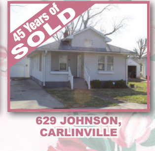
SELL? WE HAVE QUALIFIED BUYERS READY TO BUY, GIVE US A CALL. WE WOULD BE HAPPY TO DISCUSS GETTING YOUR PROPERTY LISTED.