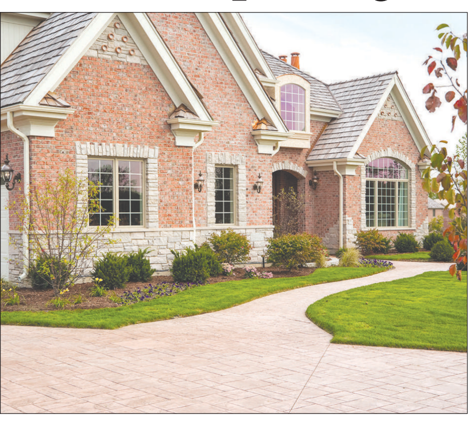
Upgrading a driveway and walkway is one way to update a home's exterior and restore its curb appeal.

Renovations are a great way for homeowners to reshape their homes. Some may aspire to renovate so their home is more reflective of their personal taste, while others may do so in an effort to make their homes better align with modern styles and sensibilities. Regardless of why a homeowner chooses to renovate, the need to do so is often evident to the naked eye, especially when the time comes to update home exteriors.