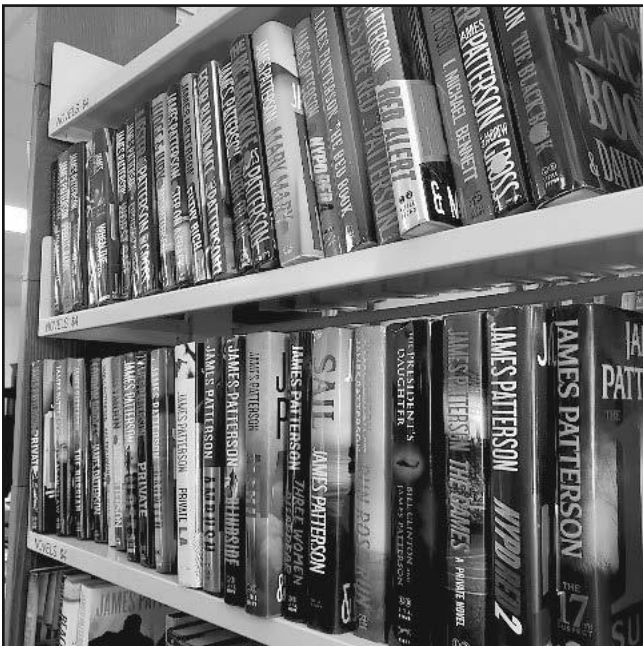
Just part of the collection. Stop in and explore.

If you are a James Patterson Fan, you're going to love the full collection in hardback of a lot of his books. And as we are still on our "Summer Sale" of 2 for 1, you can't beat it. Or if you want a paperback, we have them ready to go for super prices: Good (light weight) book for your next plane trip! We also recently received a great donation of a lot of best seller (paperback) fiction in next-to-new condition. Come on down to the Friendly Little Bookshop in the Annex Bldg. While you are here, make your way upstairs to another hidden gem, the Lake Worth Historical Museum. You will be impressed! Enter through 414 Lake Ave or Lucerne side entrance under the big Ficus trees! Hours: Saturday, 1 - 4 p.m. We take donations of Records and CDs also.