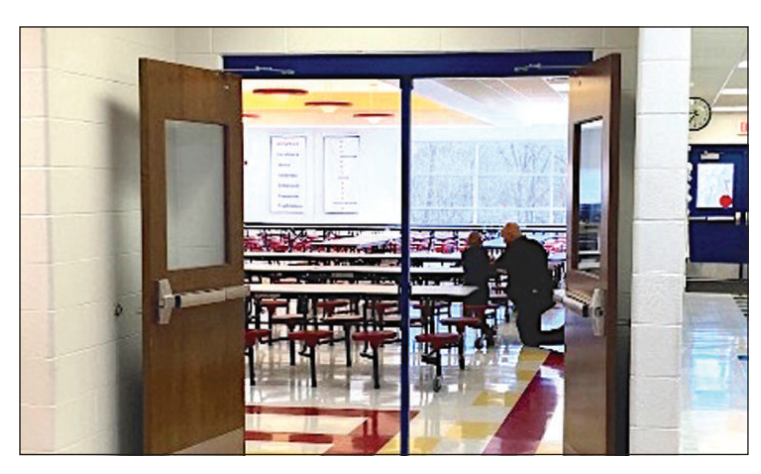
Capturing a powerful moment, Jamestown Elementary's SRO Jamie Rogers, right, is shown consoling a student in the school cafeteria. (Photo used with permission.)