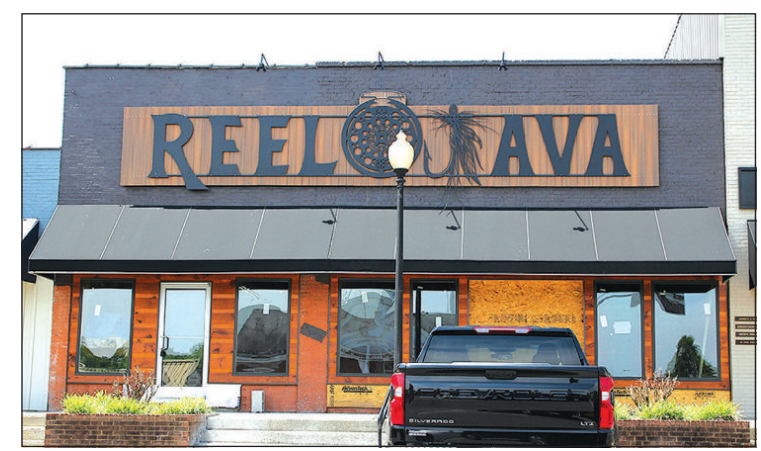
Reel Java & Creamery is expected to open later this year on the Monument Square in Jamestown.

The popular eatery, which is presently located at Timber Point Resort, is moving to a historic location on