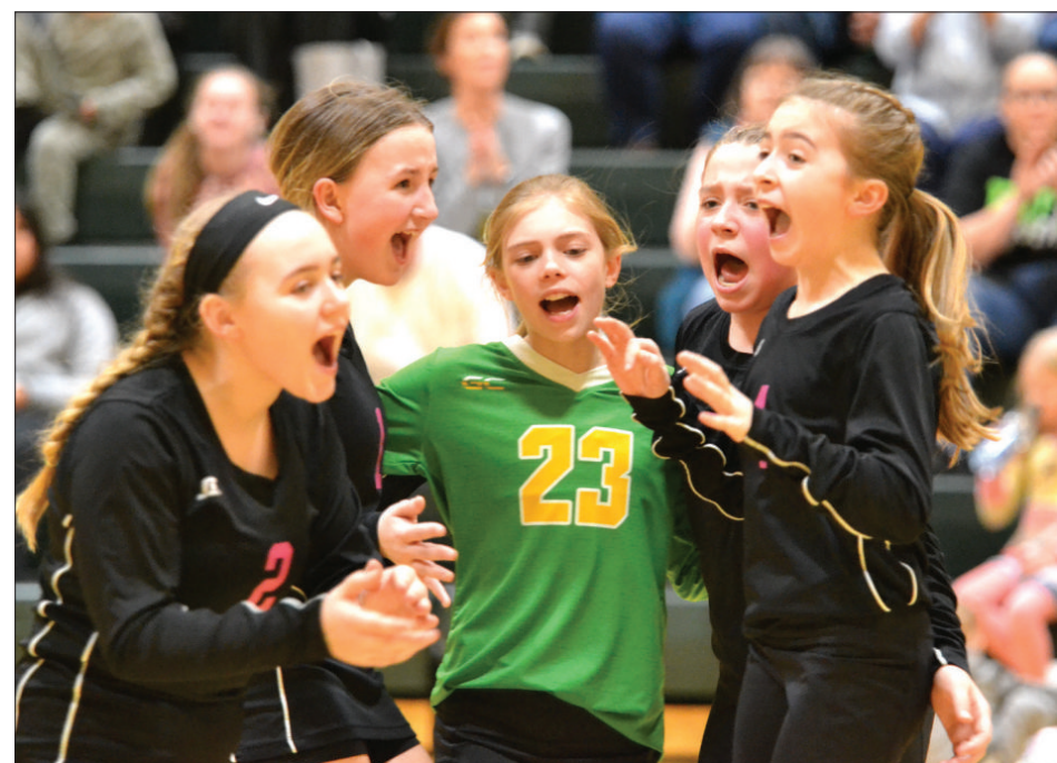
The sixth grade volleyball team celebrates a win over Metcalfe County last week.