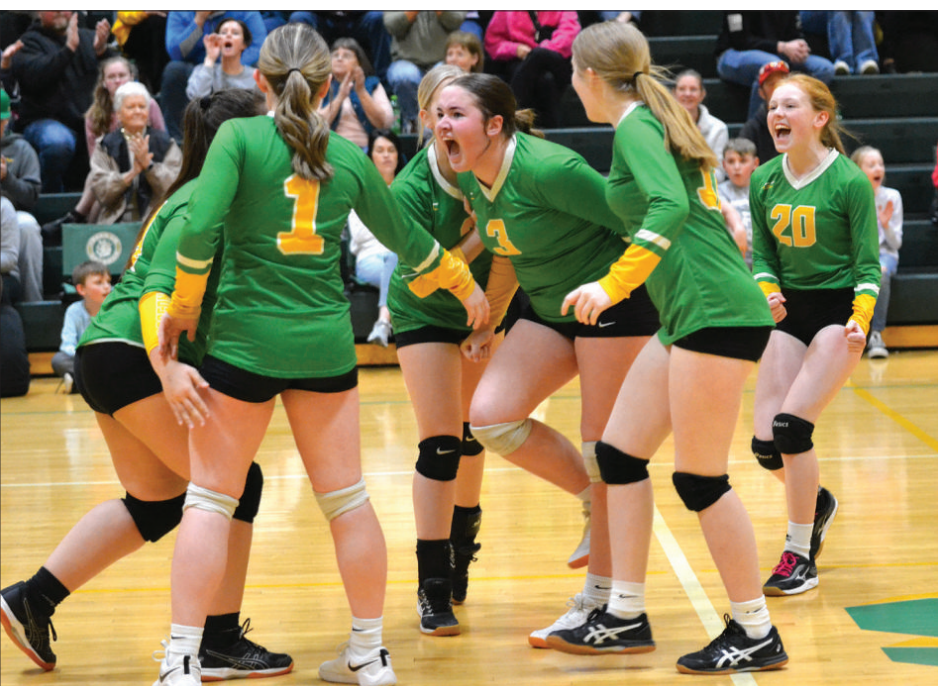
The 8th grade team celebrates a point in their game against Metcalfe County.