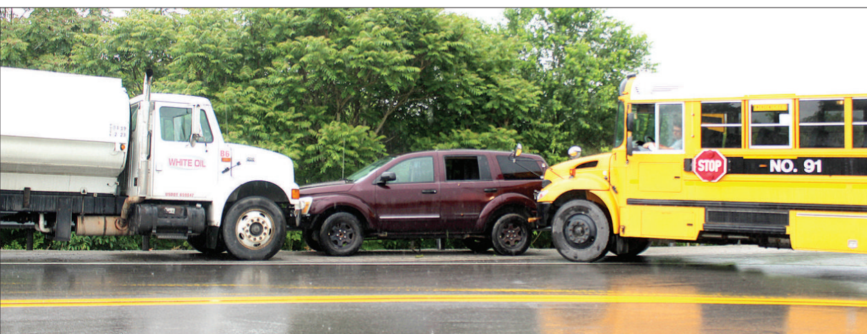
An accident at the corner of Industrial Park Road and Carlisle Avenue, featuring a fuel truck, private vehicle, and a school bus, provided the scene for Saturday's simulated training exercise involving emergency services personnel.