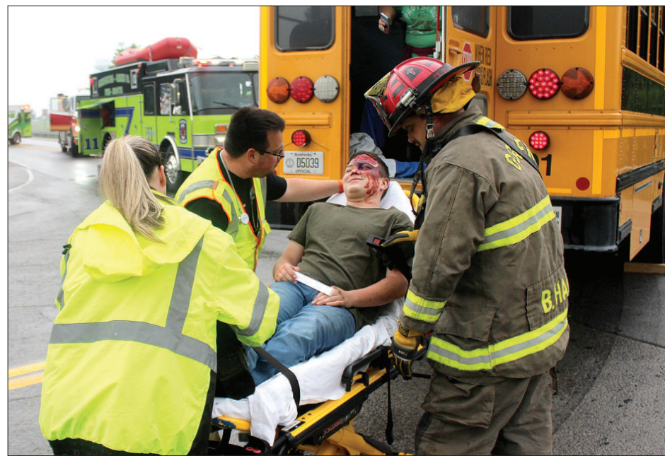
During the mock training exercise, an injured victim was prepared for transport.

An action review session was conducted after the simulated training exercise for emergency services personnel. Representatives from a number of entities, including some from other counties, were part of Saturday's event. They included: American Red Cross, City of Greensburg, Edmonson County Emergency Management (EM), Grab Volunteer Fire Department, Green County Area Technology Center Health Science, Green County Coroner, Green County EM, Green County EMS, Green County Fiscal Court, Green County Rescue Squad, Green County Schools, Greensburg Police Department, Greensburg/Green County E911 Center, Greensburg/Green County Fire and Rescue, Green County Sheriff's Department, Hart County EM, Kentucky State Police, LaRue County EM, Logan County EM, Logan County Search and Rescue, Summersville Volunteer Fire Department, Taylor County Coroner, and White Oil Company. Green County Emergency Management sponsored the emergency services training event; Greensburg/Green County Fire and Rescue served as host.