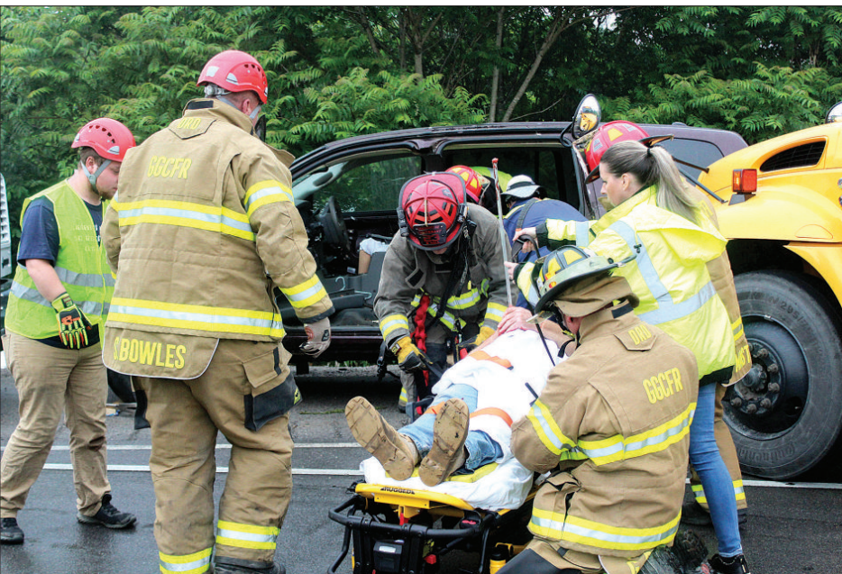
Emergency services personnel, during Saturday's simulated training practice, worked with an injured victim involved in a three-vehicle accident.