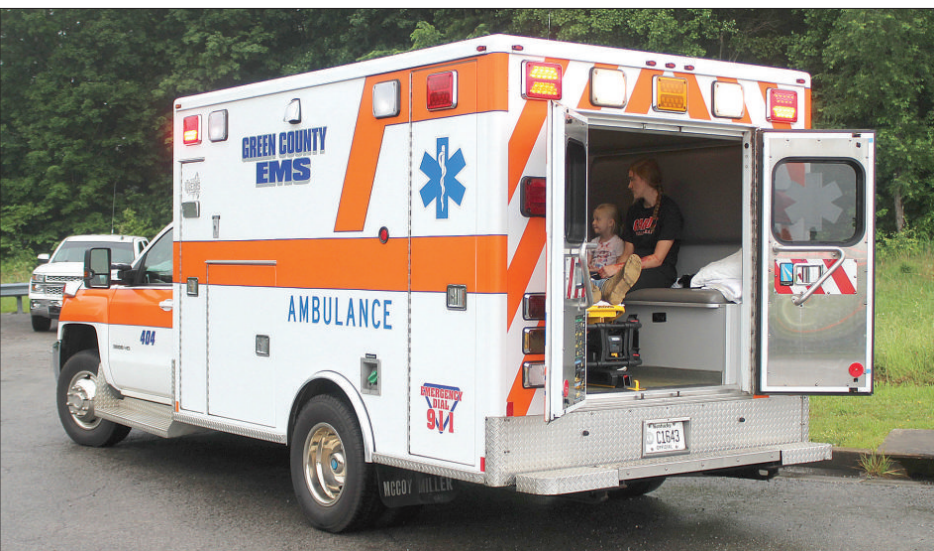
Injured accident victims waited to be carried to the triage center by a Green County ambulance during Saturday's simulated training drill.