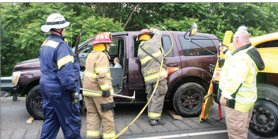
Greensburg/Green County Fire and Rescue assisted in the removal of accident victims by using a Jaws of Life during a simulated training drill Saturday.