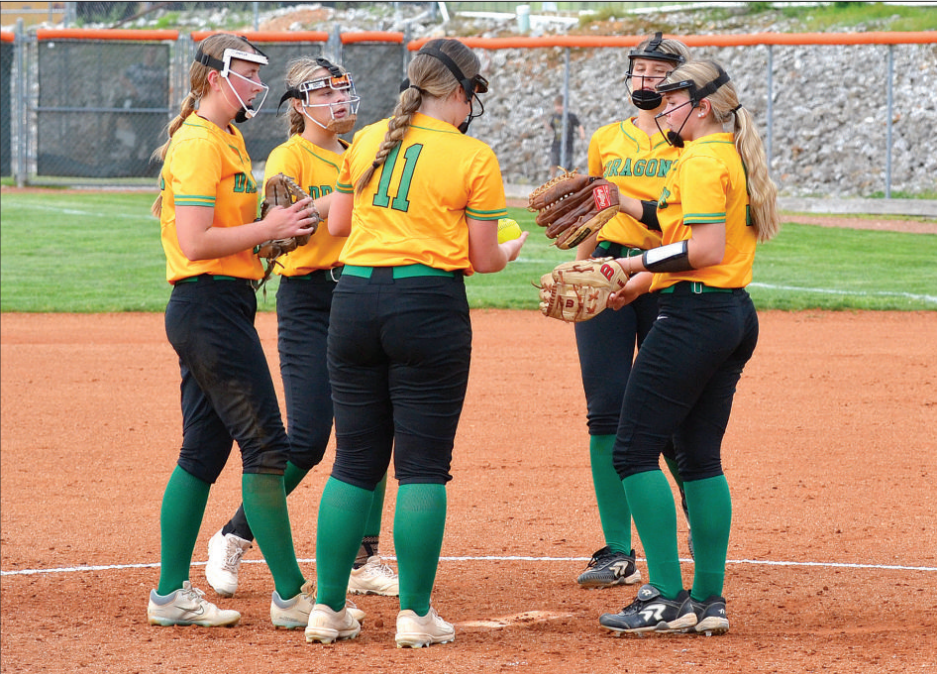
The Lady Dragon infield has a meeting on the mound against Caverna. Green County shut out Caverna 12-0 in the first round tournament game.