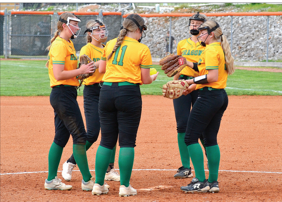
The Lady Dragon infield has a meeting on the mound against Caverna. Green County shut out Caverna 12-0 in the first round tournament game.