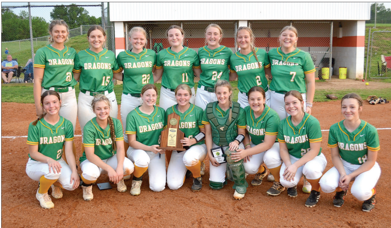
The Green County High School Lady Dragons romped through the 18th District Tournament last week at Hart County. They defeated Caverna 12-0 and beat LaRue 5-2 in the championship game.

Green County is now 18-15, heading into the region tournament.