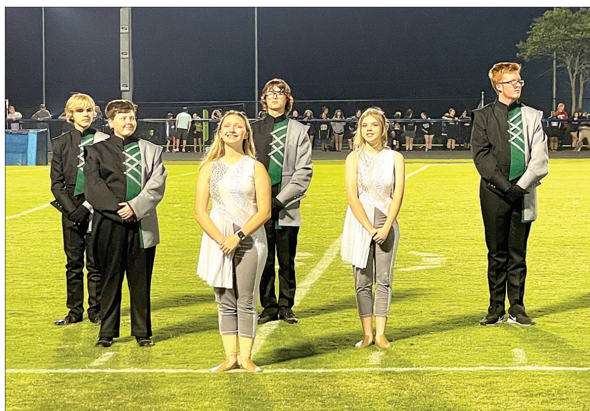
GCHS Band members await the presentation of awards at the South Central Kentucky Marching Band Classic Saturday evening in Glasgow.

“We got a lot of great feedback from the judging panel to improve our performance going into the Cow Bowl and our