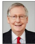
U.S. Senator Mitch McConnell

U.S. Senate Republican Leader Mitch McConnell (R-KY) delivered the following remarks Monday on the Senate floor regarding September 11: