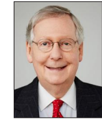
U.S. Senator Mitch McConnell

U.S. Senate Republican Leader Mitch McConnell (R-KY) delivered the following remarks Monday on the Senate floor regarding September 11: