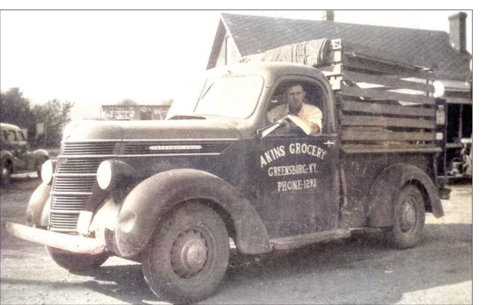
Shreve Akin behind the wheel of Akin's Grocery delivery truck, dated about 1939.