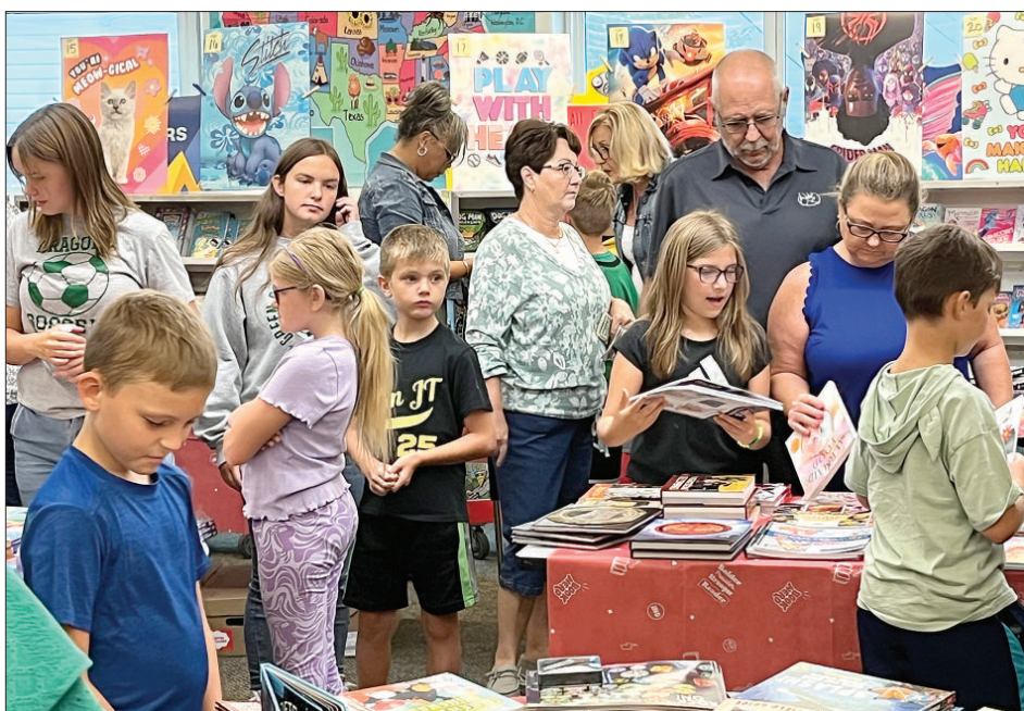
After enjoying donuts in the gym, students and their grandparents moved to the library to check out the book fair during grandparents day last week at GCIS.