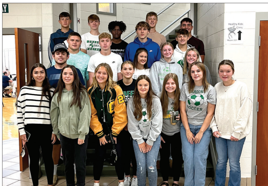
Members of the Lady Dragon Soccer team and Dragon Football team volunteered to eat with students whose grandparents were unable to make it to GCIS's grandparents day celebration last week.