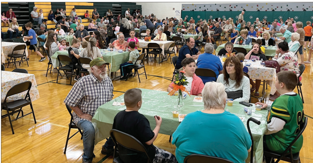
The Green County Intermediate School enjoyed a packed house for grandparents day.