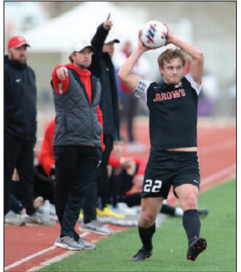
Special to The Clinton Courier