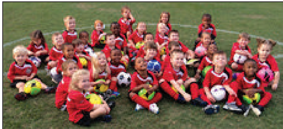
Mighty Mites, a program begun by Brilla Soccer Ministries around 2005, is credited for getting local children interested in the sport of soccer.