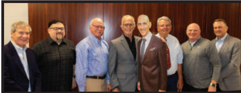
Members of the Civitan Club of Clinton