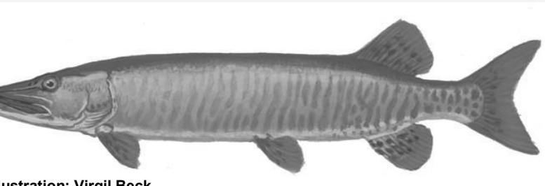
Illustration: Virgil Beck

"kinonge" is a pike. Distribution: The muskellunge occurs in all three drainage basins in Wisconsin (Lake Michigan, Mis-sissippi River, and Lake Superior) but is most widely distributed in the Chippewa, Flambeau, St. Croix, Black, and Wisconsin rivers of the Mississippi basin.