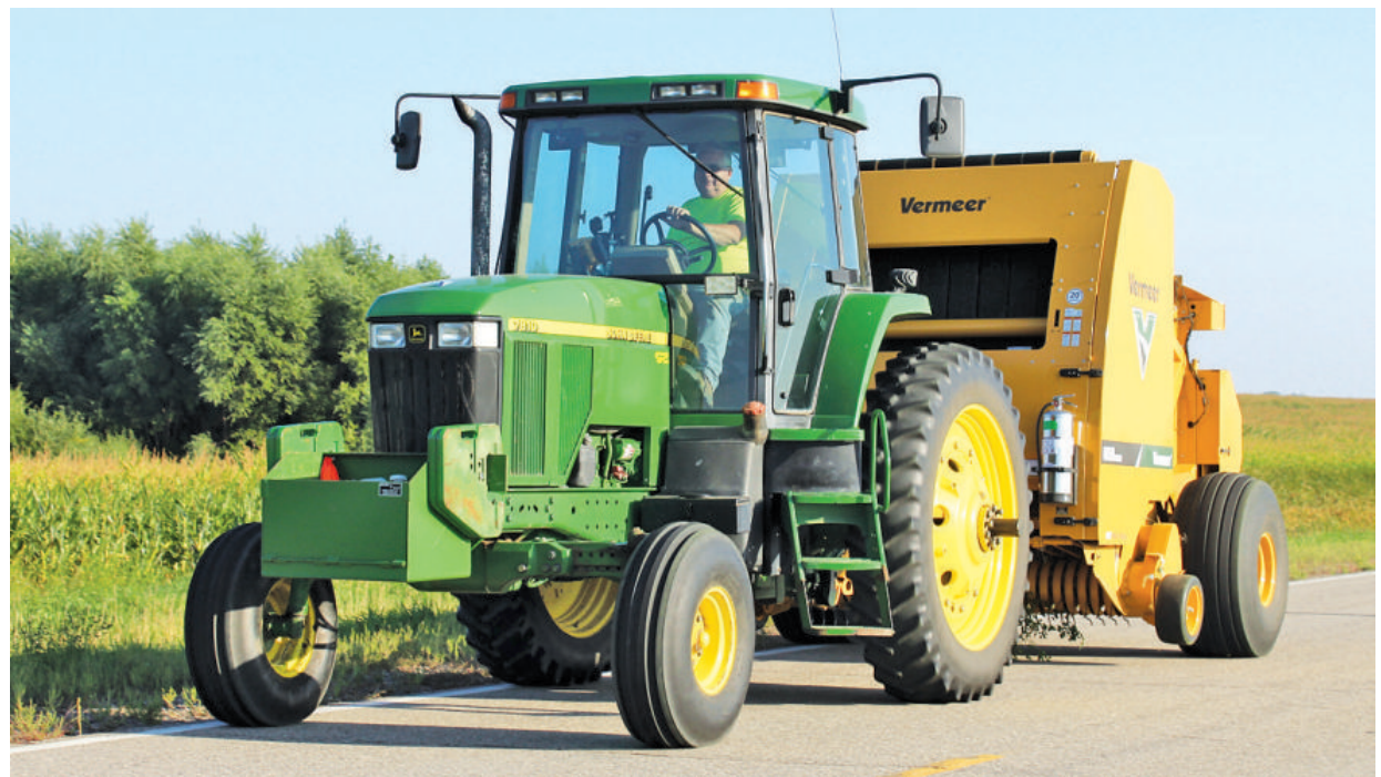
Moving equpiment from one field to another is all part of the job, but it can sure make for a longer day.