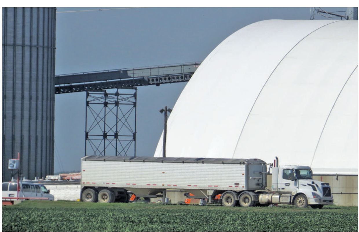
The wheat harvest has not caused the bottleneck at receiving stations that it used to. Area elevators, such as Agassiz Valley Grain in Barnesville, C-W Coop in Comstock and Wolverton and Maple River Grain had a leisurely harvest with no long lines to contend with. Everybody's wheat was ripe and dry enough to combine at different times due to uneven planting times, weather and rain conditions.