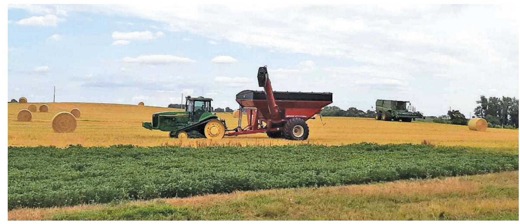
There's a little bit of everything in this harvested field of wheat north of Rothsay. The combine has done its work cutting and separating grain from straw and chaff. The grain has been offloaded from combine to grain cart then to a waiting semi in the field and finally to a bin on the farm or a local elevator. This field was done in time to bale all of the straw and prepare it for loading and hauling, making comfortable, dry bedding for animals over the winter.

early season piling. We seem to be on track for the usual busy fall harvest season which will get underway in earnest right around October 1. At that time soybeans and sunflowers should be ready to harvest very soon. Corn will be close and the annual around the clock sugarbeet campaign will hit high gear in October.