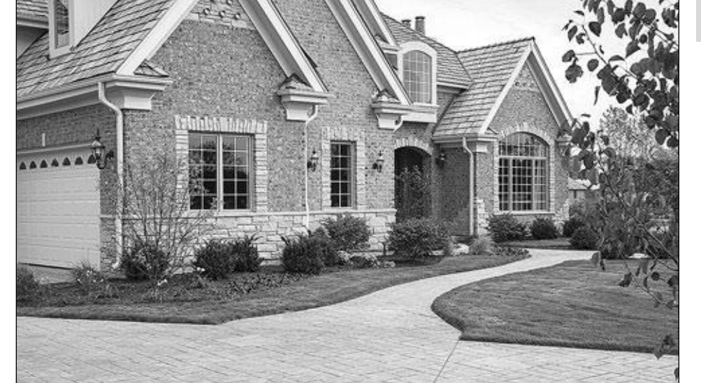
CURB APPEAL — Upgrading a driveway and walkway is one way to update a home's exterior and restore its curb appeal.

Trying to make your dream home a reality? We're here to help, with friendly associates and all the right mortgage products. Contact your nearby Simmons branch today.